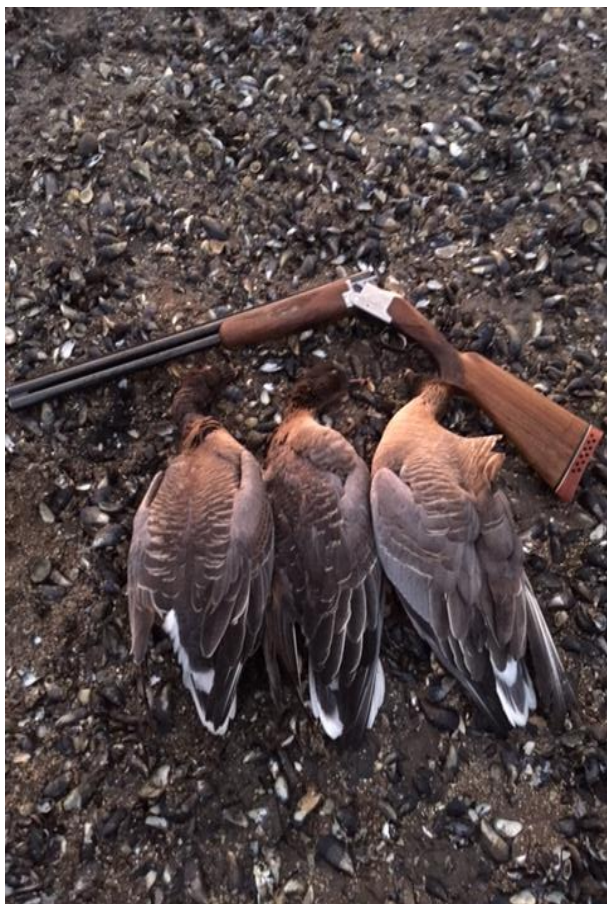
A fellow wildfowlers successful flight