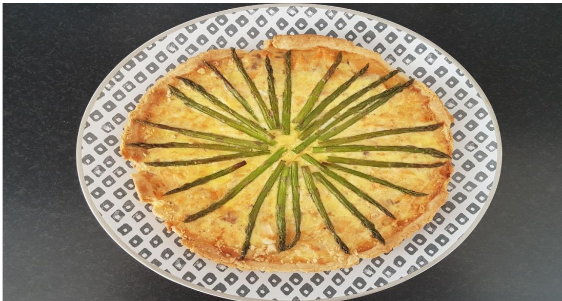
A rustic rainbow asparagus quiche was presented by my daughter Kirsty.